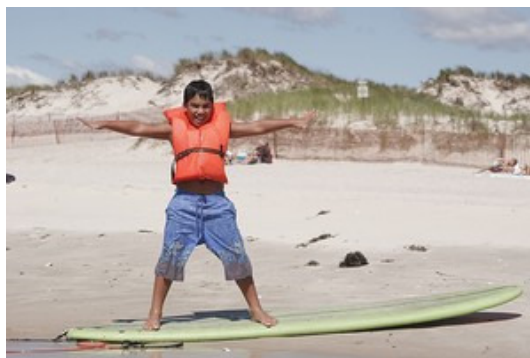
iMatter Surf Camp, Cupsogue Beach, Westhampton, NY Community Options

For more information about the camp, please visit their website or you can fan the camp on Facebook .