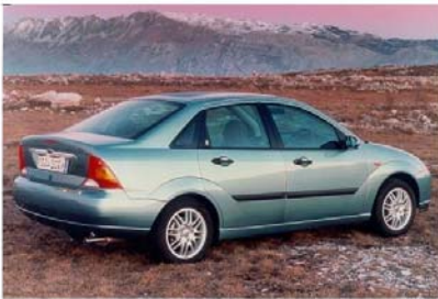
Community Options Car raffle to benefit victims of Hurricane Katrina.