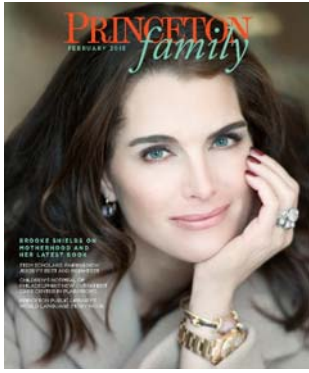
FAMILY EDITION 2015