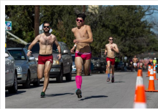
Runners participate in the Cupid's Undie Run on Nueces Street last year. The run benefits neurofibromatosis research

Rather stay at home, tucked in bed? A virtual option, "Cuddle Up for the Cause," is available for those who can't attend in person.