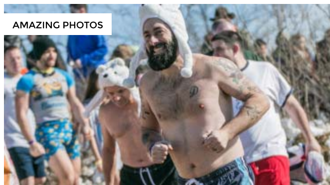
2016 Polar Bear Plunge from