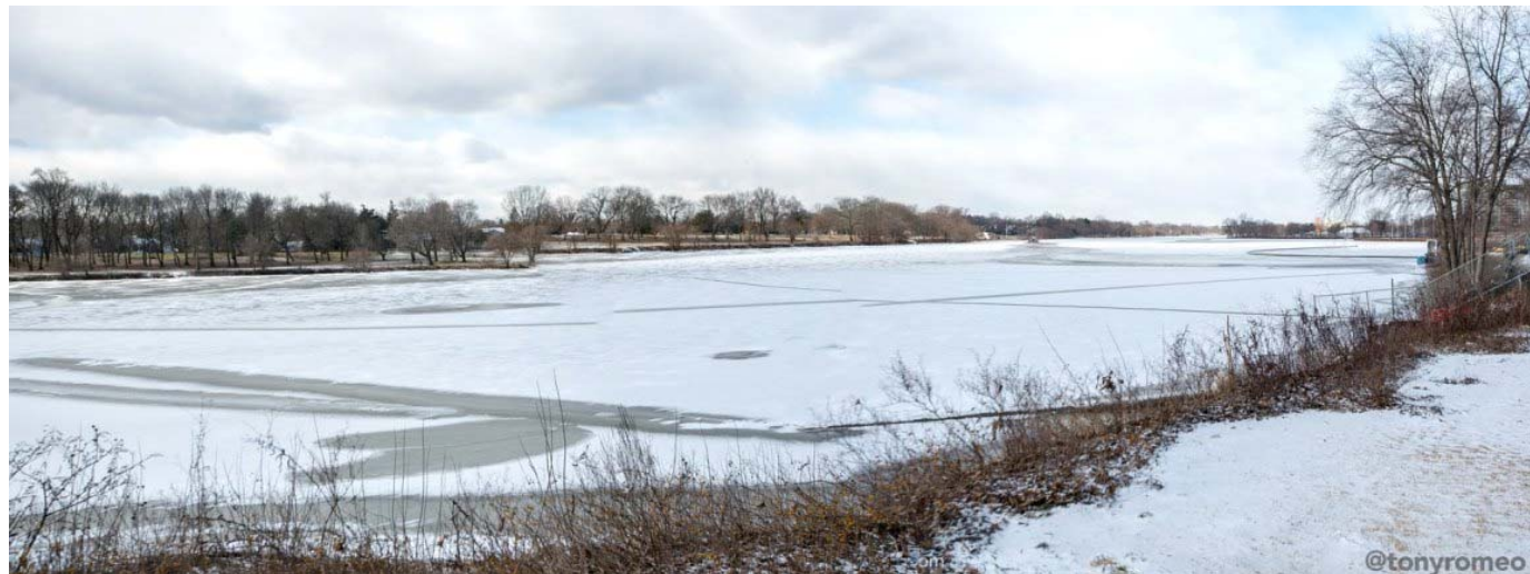
Frozen Cooper River from Cooper River Park in Camden County, NJ

temps in the low 20s and gusting winds bringing wind chill temps as low as zero at times, some brave souls braved the elements at Cooper River Park in Camden County New Jersey. The 3.26 mile course lapped a very frozen Cooper River. Great job for those that were able to put mind over matter and do this run. It was not comfortable.