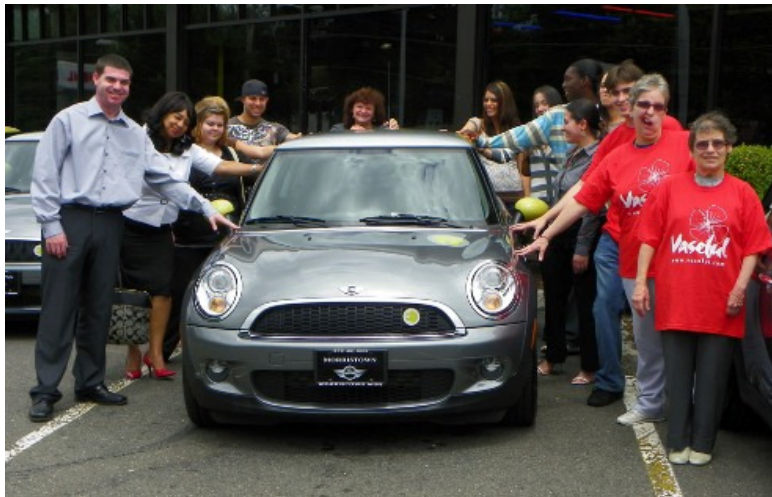
The group of recipients of the MINI Electric vehicles of Community Options, Inc.